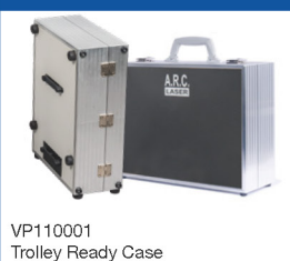
VP110001 Trolley Ready Case