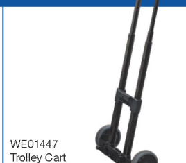
WE01447 Trolley Cart